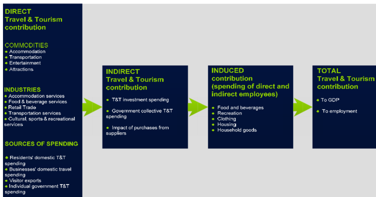
Figure 1. Impact of Travel and Tourism Sector to GDP Growth