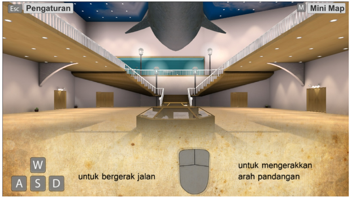
Figure 4. First person shooter viewpoint

To evaluate whether this application accomplish its original objective, participants are requested to use this application and explore overall area. Figure 4 show the first person shooter viewpoint when user explore the area.