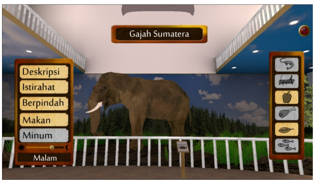
Figure 5. Available menu settings

At the end of the evaluation, 95% participants can named all the critically endangered and endangered species covered in this application correctly. Moreover, 90% participants state that they can grasp the information available in this application easily; this claim is strengthen by the fact that most of the respondents can identify information uncovered in the application. Regarding user experience, none of the participants needed help about the control, which means the interface is simple and easy to be used.