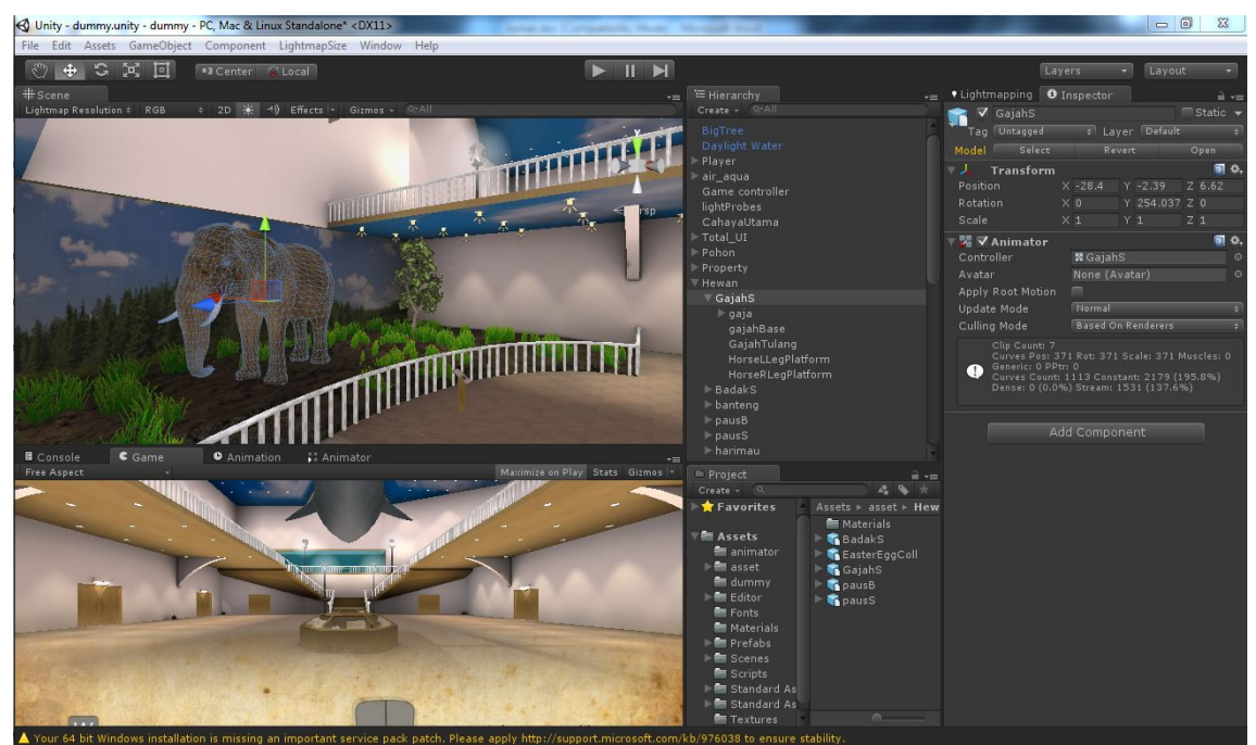
Figure 3. Final Implementation

To evaluate whether this application accomplish its original objective, participants are requested to use this application and explore overall area. Figure 4 show the first person shooter viewpoint when user explore the area.