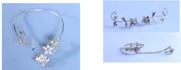
Figure 3. Product Design