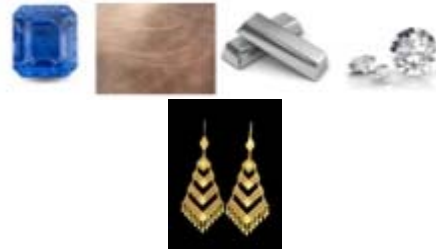
Figure 1: Color, geometric shape, texture used

Based on shape The form applied to the jewelry is a form of the existing culture in Mojokerto. The applied shape is a geometric shape.