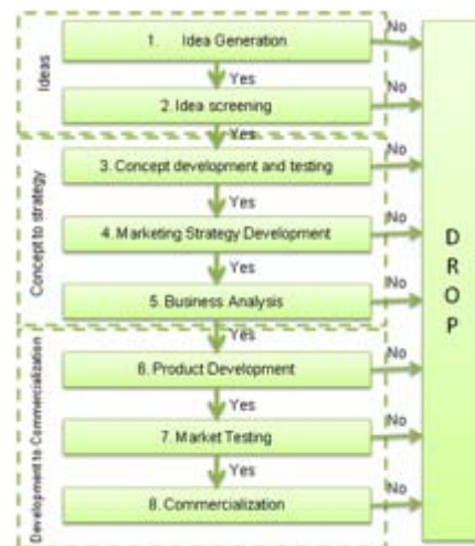
Diagram 1: New Product Development

According to Kotler in the book Marketing (1987), important steps in product development seen in the picture below.