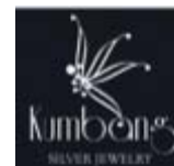
Figure 4. Logo

Logo style is using line as main visual element, with no sharp edge, combine with brand naming and byline application to create clear meaning for the product. Using single color with high contrast like white on black or vice versa.