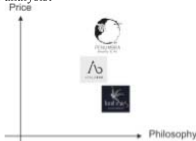
Diagram 4: Product placement

Product placement is where the value of philosophy is higher with the price is somewhat lower than competitors Middle East brand. This product placement is tailored to a product brand that also sells Middle Eastern jewelry worth of philosophy ie Penumbra Jewelry and Ayala Bar. Test marketing Standart Test Market: follow some jewelry exhibition to introduce products and get positive feedback from consumers.