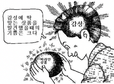
Figure 1. Experiential Kansei and user/customer (adopted from Nagamachi & Lokman, 2011)

Emotional satisfaction is concerned once all the determinant needs have been fulfilled. It reminds us to the concept of human hierarchy of needs by Maslow. Once the lower level of needs is fulfilled, the upper level of needs (such as social and self-esteem needs) will be more important. The highest one is that self-actualization. It is quite related to emotions/affect/Kansei. Another similar theory called as the motivator-hygiene two-factor theory by Frederick Herzberg. People are mostly motivated by the achievement, recognition, responsibility, rather than company policy, supervision, relation with colleagues. It seems that they have similar pattern. Once the cognitive need is satisfied, it drives the emotional need and satisfaction. In other words, emotions/affect/Kansei is a function of the perception of product/service/working condition or other human-system interaction.