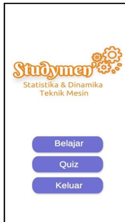
Figure 1. Main view

which consists of material 1 regarding units and material 2 related to basic mathematics (see Figure 2). Meanwhile, the quizzes menu can be seen in Figure 3 which consists of instructions, quiz 1 to quiz 4. The quizzes are levels according to the philosophy of the bloom taxonomic level.