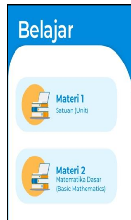
Figure 2. Learning view