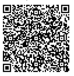
Medan, 18 February 2023