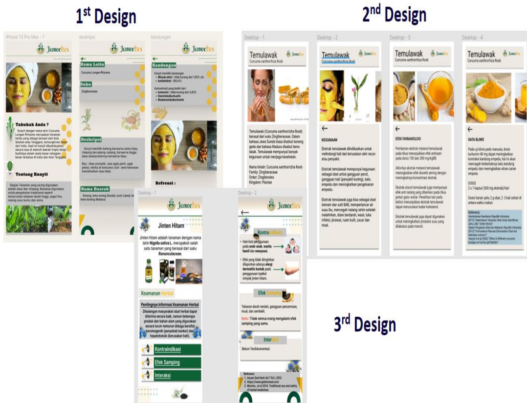
Figure 1 Selected design of online information card about characteristic, usage and safety of herbal medicine

The number of respondents who evaluated the results of the OIC design, as seen in Figure 1, was 60 people with appropriate inclusion criteria, the number of respondents was more than 30 respondents to be able to obtain accurate survey results as mentioned by Hogg et al. (2015). The majority of respondents were aged 17 up to 25 years (54.29%), with the last education being high school (47.14%). More than half of respondents (51.42%) use smartphones very often and use the internet, for more than 16 hours per day, so that it is hoped that respondents can operate the educational media provided. The findings in this study are in accordance with previous research by Yunita et al. (2022 a ) and Yunita & Theterissa (2022).