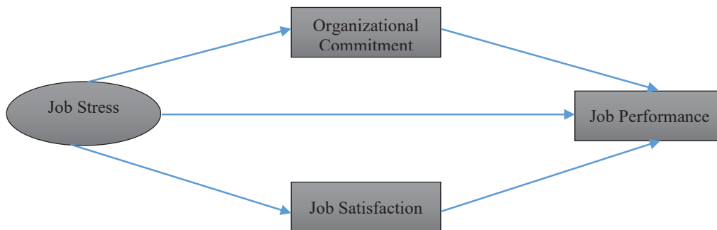
Figure 1. The relationship between job stress, organizational commitment, jobs satisfaction and job performance