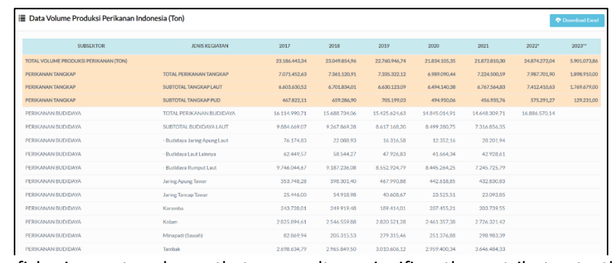
Table 2. Indonesia Fisheries Production Volume.

The fisheries sector shows that aquaculture significantly contributes to the nation's fisheries production volume. From a provincial distribution perspective, the East Java province makes one of the most extensive contributions, as seen in Table 3 below.