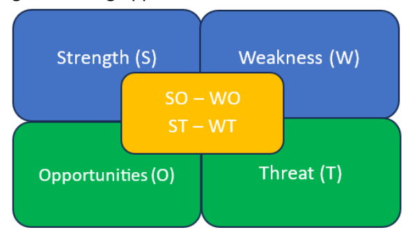
Figure 2. SWOT Framework

The research employs a SWOT analysis method, which involves an assessment of the internal and external conditions of the fisheries environment in the East Java region. The analysis undertaken aims to identify the strengths, weaknesses, opportunities, and threats within the aquaculture sector in East Java. This assessment relies on qualitative and secondary data from the fisheries department and the Ministry of Marine Affairs and Fisheries. Subsequently, based on the findings of this analysis, strategic formulation is carried out using the TOWS method. TOWS represents a strategy developed to address weaknesses and challenges by leveraging strengths and capitalizing on existing opportunities.