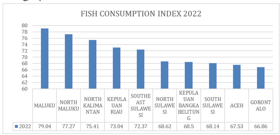
Figure 3. Fish Consumption Index 2022

East Java also has a low domestic fish consumption rate. As can be seen from the figure below, East Java was not included as the most consumptive region when it comes to fish. East Java's fish consumption index was 42.45 Kg/Capita, way below the national fish consumption target of 54 Kg/Capita.