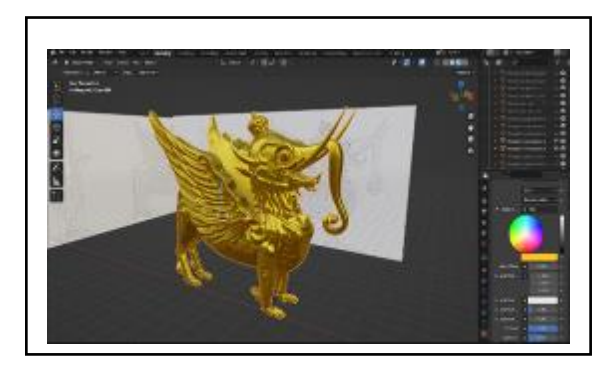
Figure 2. 3D Model of Sculptures

and Dayak tribal ornaments arranged to form a frame. The initials of the sculpture 3D model will be displayed in the middle of the marker. The design concept for the entire application and pocketbook uses natural themes and materials from sculptures and ornaments from the Dayak tribe. The 3D model created must be adapted to the original sculpture to maintain its uniqueness and sacredness. The motifs or plots used are those in the original Dayak sculptures. Figure 2 shows one of the 3D models of sculptures in the Dayak Tribe, East Kalimantan.