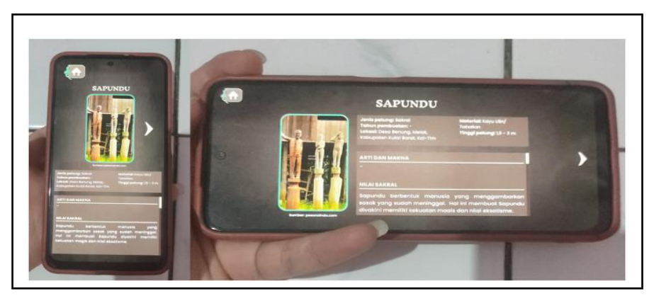
Figure 5. Sculptures Catalog Page with Vertical and Horizontal Orientation

On the sculptures catalog page, there is a photo, photo source, brief description, and paragraph of the sculptures, as in Figure 5 regarding the sculptures catalog page with vertical and horizontal orientation. The information conveyed in the application is relatively complete but has few words. So that users who read it are more comfortable with lots of visuals/images. Brief information provided in the application is the type of sculptures, year of manufacture, location, material, and height of the sculptures. Apart from that, the information needed is the meaning and significance of the sculptures, if any. Then an explanation of the sacred value of a sculpture.