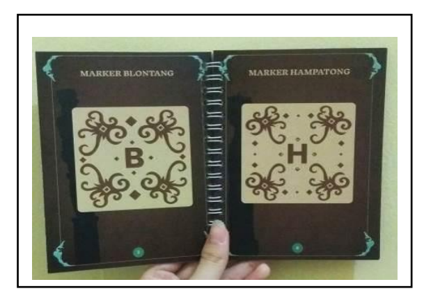
Figure 3. Pocketbook Marker Page

Next, the implementation stage is carried out on the previously designed design. From the design implementation results, we will continue with the verification stage of the AR statute application and pocketbook, which is a companion to the application. The pocketbook contains a marker page of the sculptures, as shown in Figure 3.