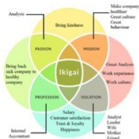
Figure 3. Ikigai of Internal Accountant

more knowledge and experiences. From those things, he gets salaries from the maximum results of his team, he gets joyfulness through the holiday, and he gets a better team to handle clients and his client may increase since his team is getting better and better. The combination of what he gives and what he gets is called vocation. So, in handling clients, he's a partner of his public accounting firm. In his family, he's a father and also a husband for his wife. And in his team, he's a great leader to lead his team to have a better performance. Without harmony, there won't be any mutual relationship. From his vocation to some people, these show the harmony and sustainability which're related to the third pillar of ikigai.