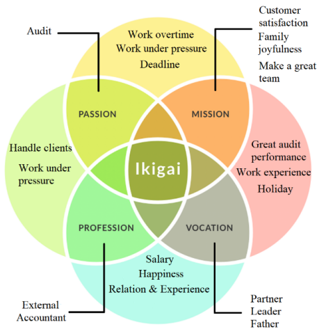
Figure 2. Ikigai of External Accountant

implicitly which's one of the proofs that his children grow mature and can give feedback also to his father. These show a lot of sustainability and harmony between him and his student, his family, and also his children. He learned his happiness from his child and it enhances his motivation to be more focused on teaching also. Here is the third pillar of ikigai works, harmony and sustainability.