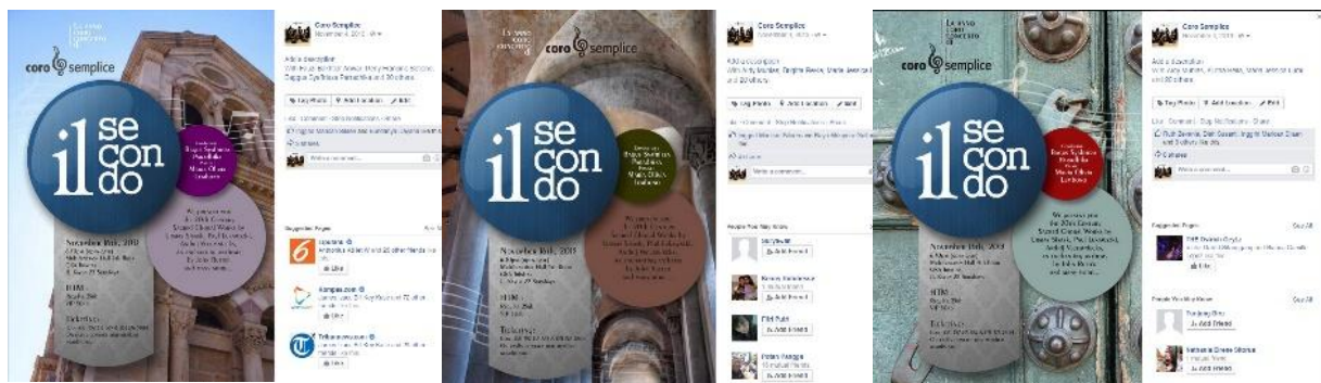
Picture 5. Poster Online, Il Secondo, Coro Semplice Indonesia