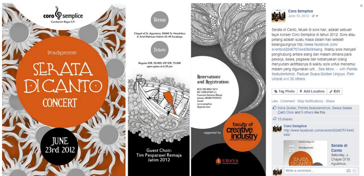
Picture 4. Poster Online, Serata Di Canto Concert, Coro Semplice Indonesia