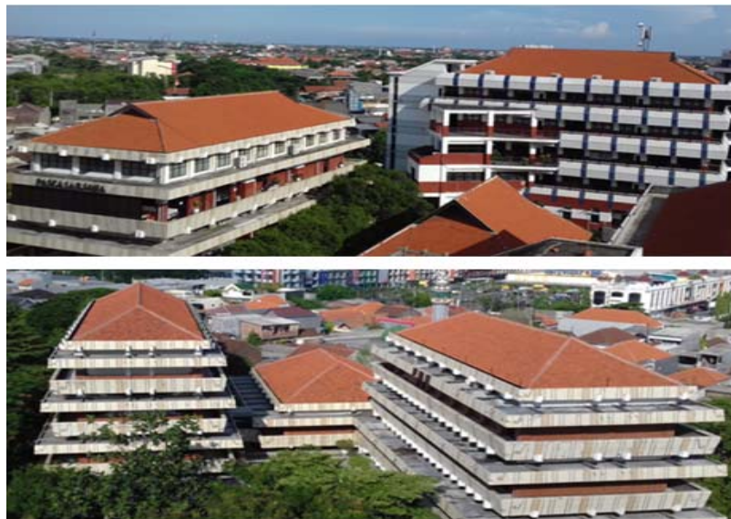
FIG. 1. Typical Building of University of Surabaya

The simulation results from EDGE software are shown in Table 2. It shows the codes, the referred measures, and