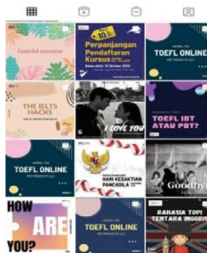
Figure 2. Example of social media marketing conducted by the course

The type of digital marketing used by the course is social media marketing, specifically instagram, since most of the customers of the course are university students and some school students, as this generation mostly use and have their own social media. Instagram marketing is able to attract people who are online to visit the instagram of the course and then take a look at the content. The content consist of some information related to the course program (opening of the course, test program), tips and trick in learning foreign languages, common grammar mistakes, and many more. This content can make people who are interested on it, finally follow the instagram account of the course. Indeed, these followers are prospect customers who are able to get notification whenever the course uploads new content in the instagram.