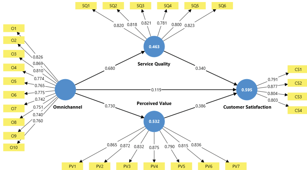
Figure 2. Model Test Result

The first hypothesis ( H_1 ), which posits that omnichannel implementation positively affects service quality, indicates a strong and significant relationship (Iskandar et al., 2023). Integrating online and offline channels provides a seamless experience across multiple touchpoints, enhancing customers' perceptions of reliability, responsiveness, and consistency. From the Service-Dominant Logic perspective, service quality is co-created through continuous interactions between firms and customers, and effective coordination between digital and physical platforms—such as synchronized ordering systems and unified customer support—reinforces trust and overall service evaluation (Vargo & Lusch, 2016; Lusch & Vargo, 2018; Nursalim et al., 2024). Recent studies further show that omnichannel integration strengthens perceived service quality and customer satisfaction (Truong et al., 2023; Nursalim et al., 2024). In Indonesia's fast-food sector, these results underscore the importance of combining technological efficiency with human interaction to deliver consistent, reliable, and customer-centered service (Iskandar et al., 2023).