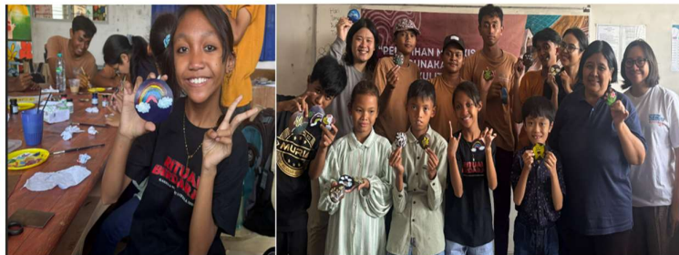
Figure 5. Training on Cowhide Painting in SLB Kristen Pelangi Kasih, Lumajang

This painting training aimed to facilitate the development of artistic talents of children with special needs (see Figure 5). They typically used canvas, paper and fabric materials as the mediums for their paintings. However, in this training they were trained to do painting on cowhide. This training was attended by SLB students with hearing and speech impairment, ranging from SDLB) and Special Needs Junior High School (SMPLB) to Special Needs Senior High School (SMALB).