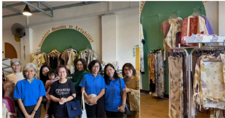
Figure 3. The Gallery of SLB Kristen Pelangi Kasih

Furthermore, SLB Kristen Pelangi Kasih also has a school business unit, namely a gallery called Payung Arsa (see Figure 3). The gallery was founded as an exhibition room for students' products to be sold to the community. The establishment of the gallery facilitates the online showcase and sale of students' artworks via the school's social media.