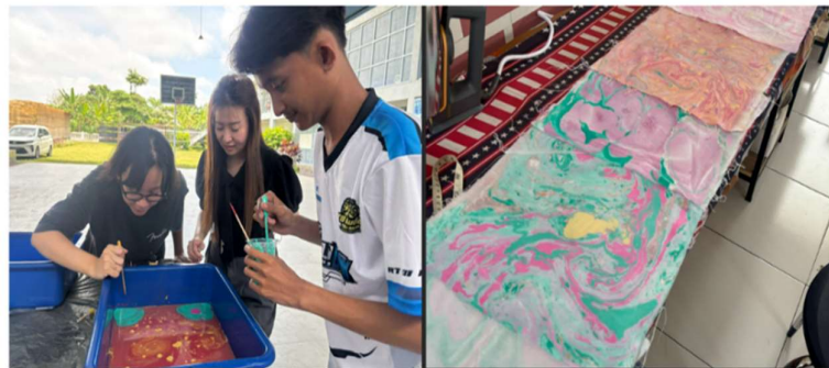
Figure 6. Training on Fabric Marbling

Fabric marbling is a technique that involves creating a marble-like motif on the surface of fabrics, thus it is called fabric marbling. Previously, the team observed that the fashion design vocational program primarily used fabric materials with mainstream motifs. Therefore, the training was designed to provide teachers with new insights into alternative fabric motifs. Interested in expanding their range of design variations, SLB Kristen Pelangi Kasih welcomed this idea (see Figure 6).