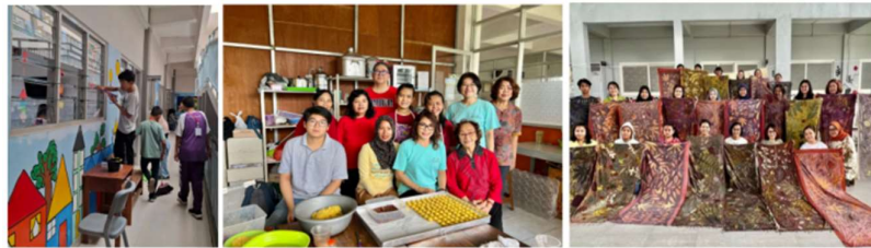
Figure 1. Vocational Education at SLB Kristen Pelangi Kasih

The school's vocational education program offers a range of skills, including painting techniques, culinary art, beauty care, screen printing, batik making, eco-printing and fashion design. The ABK are allowed to choose to specialize in specific skills based on their personal interest, with guidance from teachers. Needless to say, the learning process of the vocational education involves the active participation of parents, ensuring that they are well-informed about their children's development. Moreover, parents with practical expertise or vocational business are occasionally involved as keynote speakers to share their knowledge and skills with the SLB students (see Figure 1).