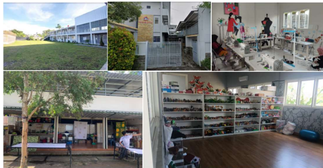
Figure 2. Facilitations at SLB Kristen Pelangi Kasih

The SLB is equipped with supporting learning facilities which include classrooms for learning activities, vocational laboratory, which is tailored to various programs, open spaces (courtyards and gardens), a health center (UKS), teacher and staff room, auditorium, and hydroponic garden (see Figure 2).