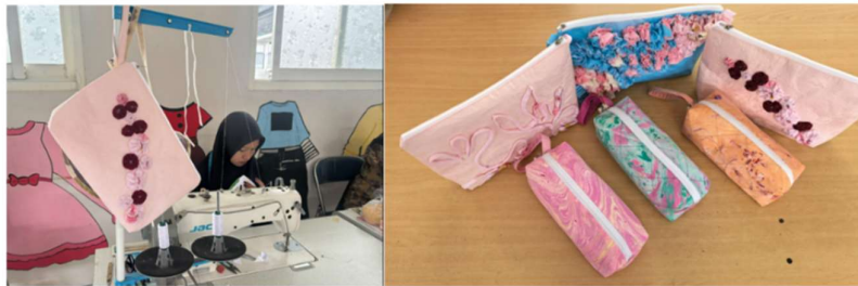
Figure 7. Sewing Training Using Patchwork Waste

As in garment-sewing industries, the fashion design vocational program generates a great amount of patchwork waste, which can no longer be used for producing garments. The Community Service Program Implementation Team observed that the patchwork waste in SLB Kristen Pelangi Kasih tended to accumulate without being reused. Through this training, the team attempted to cultivate environmental awareness by encouraging them to take responsibility for the patchwork waste generated from their sewing activities (see Figure 7).